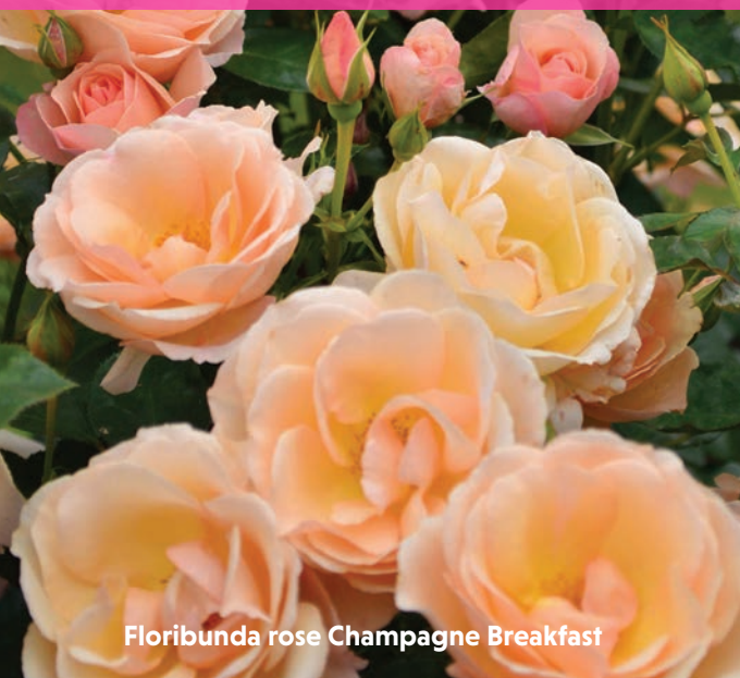
Floribunda rose Champagne Breakfast