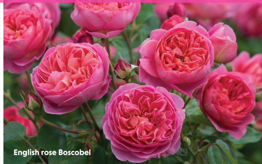
English rose Boscobel