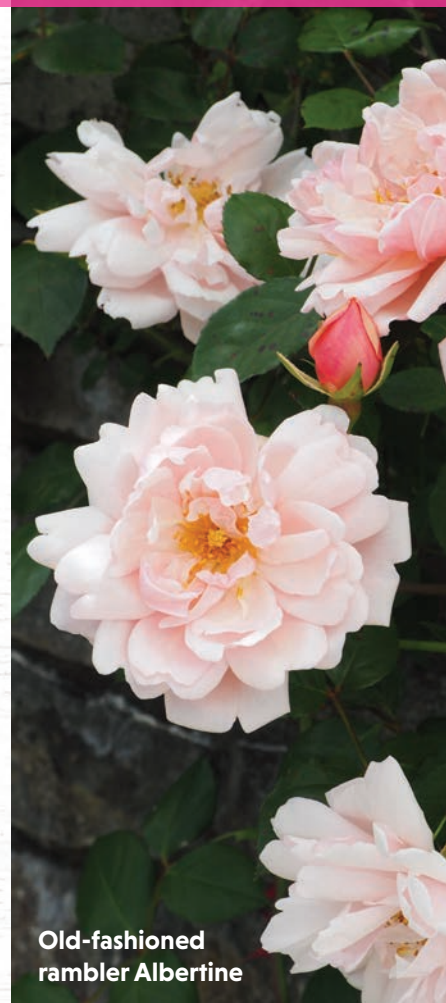
Old-fashioned rambler Albertine