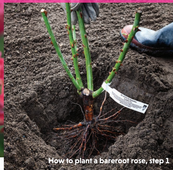
How to plant a bare root rose, step 1

Ask our team in store for the best roses to suit your garden and situation.