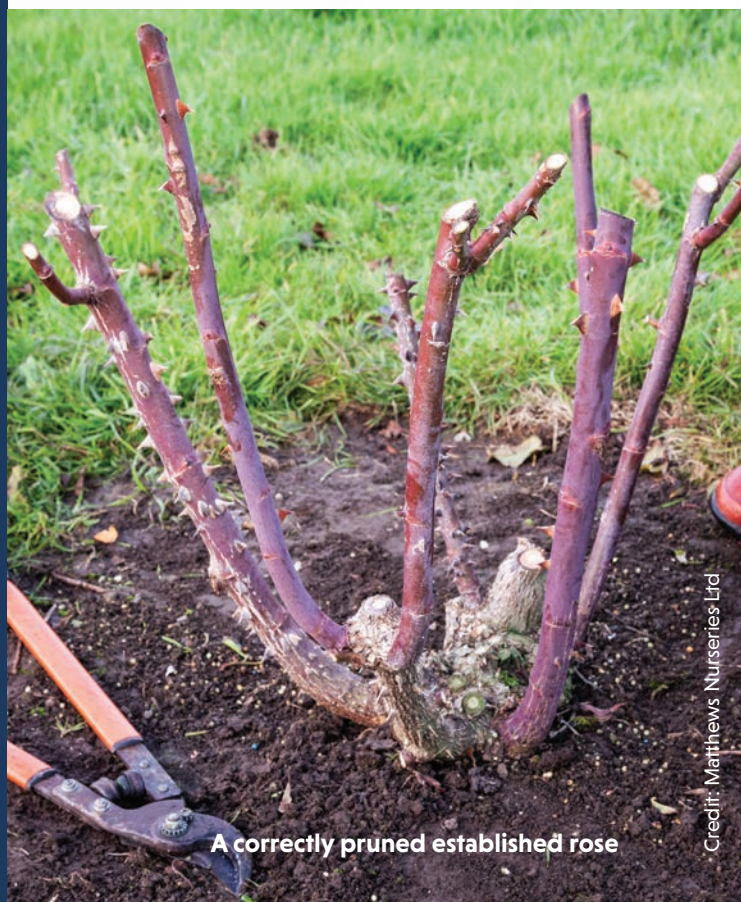
A correctly pruned established rose