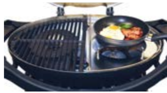
TRIVET KIT 547955