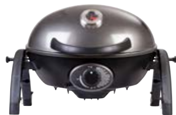
PORTABLE GRILL 552911