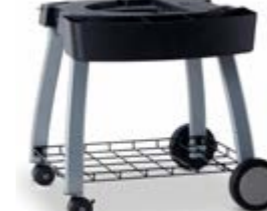
552914 - TWIN 552916 - TRIPLE