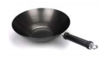
DURABLE CARBON STEEL, 31 CM, NON-STICK WOK 547943