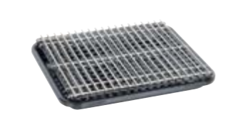
BAKE & ROAST PACK Includes deflector tray, baking rack & roasting tray 547948