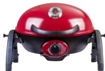
PORTABLE GRILL 552917