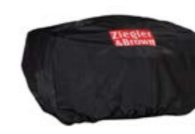
SMALL COVER For BBQ only 547957 - TWIN 547944 - TRIPLE