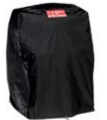
LARGE COVER Protects the BBQ & optional cart 547958 - TWIN 547945 - TRIPLE