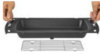
BAKING DISH 547968