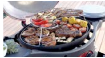
GRILL WARMING RACK 547956