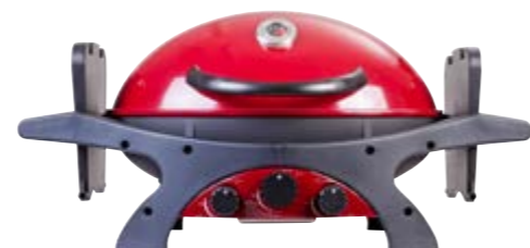
TRIPLE GRILL 552920