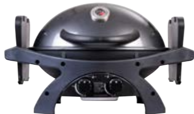
TWIN GRILL 552913