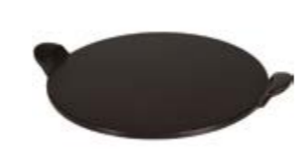
PIZZA STONE Ceramic coating, side handles, available in 30 cm - 547965 or 38 cm - 547942