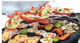
GRILL WARMING RACK 547941