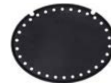
FULL CAST IRON HOTPLATE 547960