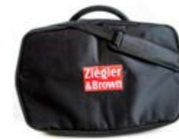
CARRY BAG Includes a shoulder strap. Comes with storage pockets for extra accessories. 547971