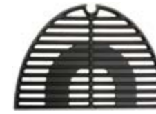
HALF GRILL 547961