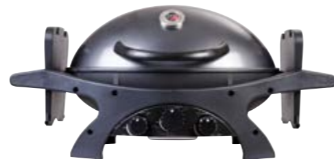
TRIPLE GRILL 552915