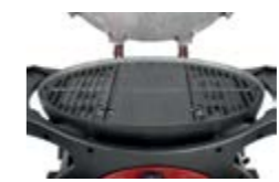
REVERSIBLE CENTRE HOTPLATE 547940