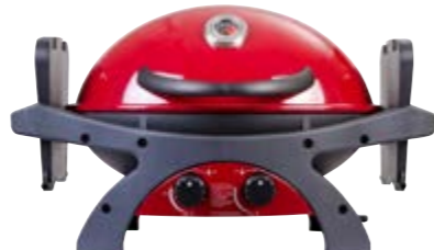
TWIN GRILL 552919