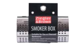
SMOKER BOX 549838