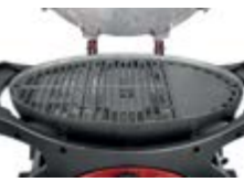
REVERSIBLE SIDE HOTPLATE 547939