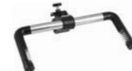
HANDLE MOUNT BBQ LIGHT 547946