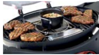
REVERSIBLE TRIVET 547969