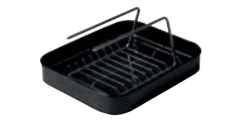
ROAST PACK Includes drip tray, roasting rack and roasting tray 547949