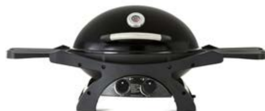
TWIN GRILL 552961