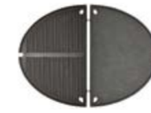
REVERSIBLE HOTPLATE 547954