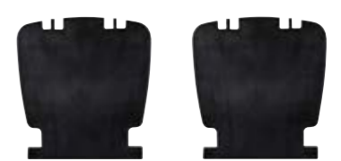
SIDE SHELVES 547928 - TWIN 552914 - TRIPLE