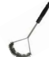
EASY REACH CLEANING BRUSH 547966