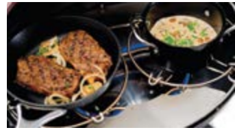
TRIVET KIT 547967